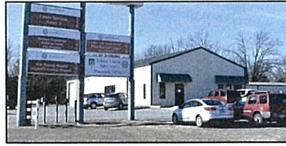
Cherokee County Employment and Training 17138 S. Muskogee Ave. Tahlequah, OK 74465 918-453-5555