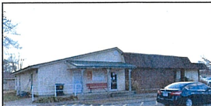
Delaware/Ottawa County Jay Office 1178 W. Cherokee Jay, OK 74346 918-253-3243