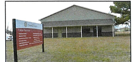
Muskogee/McIntosh County Muskogee Office 1305 S. Country Club Rd. Muskogee, OK 74403 918-682-2077