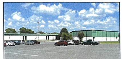
Rogers County Catoosa Office 701 W. Rollins Street Catoosa, OK 74015 918-342-7450