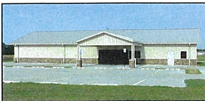
Washington/Craig/Nowata Co. Vinita Office 27469 S. 4410 Road Vinita, OK 1-800-256-0671 ext.: 2501