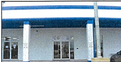
Adair County Stilwell Office 406 A W. Locust St. Stilwell, OK 74960 918-696-3124