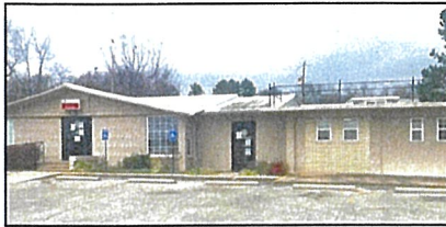
Cherokee County Learning Center 17822 S. Muskogee Ave. Tahlequah, OK 74465 918-458-0577