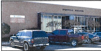
Sequoyah County Sallisaw Office 100 E. Choctaw Ave. Sallisaw, OK 74955 918-776-0416