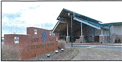
Cherokee County Tahlequah Office 17675 S. Muskogee Ave. Tahlequah, OK 74465 918-453-5555