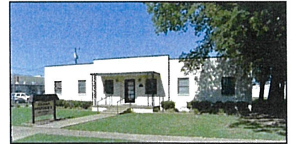
Wagoner County Wagoner Office 109 N. Casaver Wagoner, OK 74467 918-453-5555