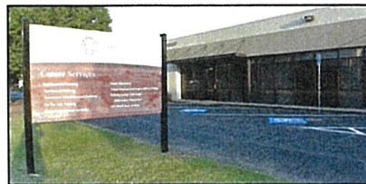
Tulsa County Tulsa Office 10837 E. Marshall St. Tulsa, OK 74116 918-574-2749