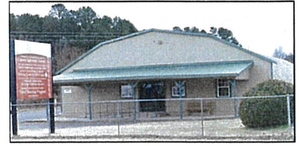
Cherokee County TERO and TLJC Office 16389 S. Muskogee Ave. Tahlequah, OK 74465 918-453-5334