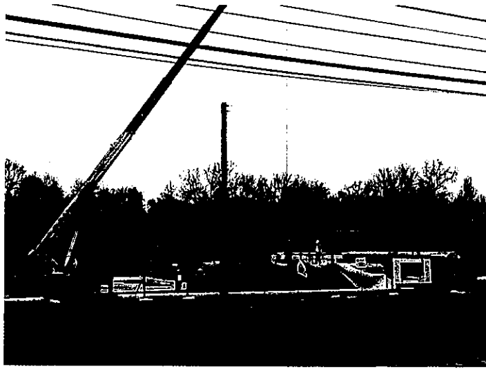
Materials Delivered - Down town Pavilion February 21, 2018