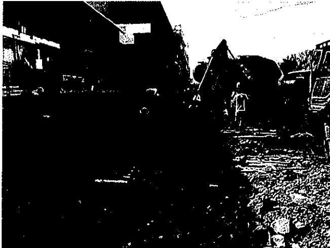
Work on loading dock area – CN Outpatient Health Center February 19, 2018