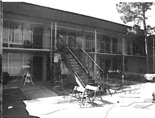
Tsalagi Office Annex