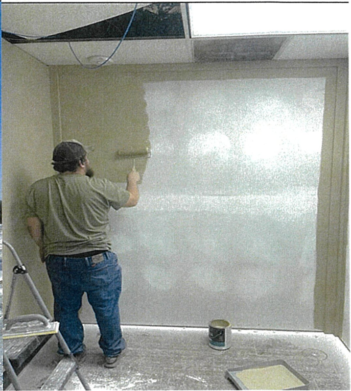
Remodel in Complex