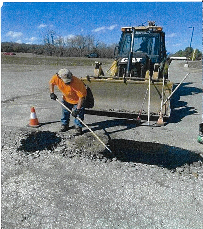
Parking lot repair