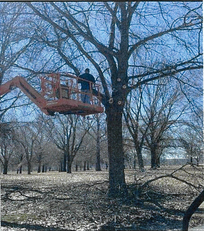
Tree trimming at Powwow Grounds