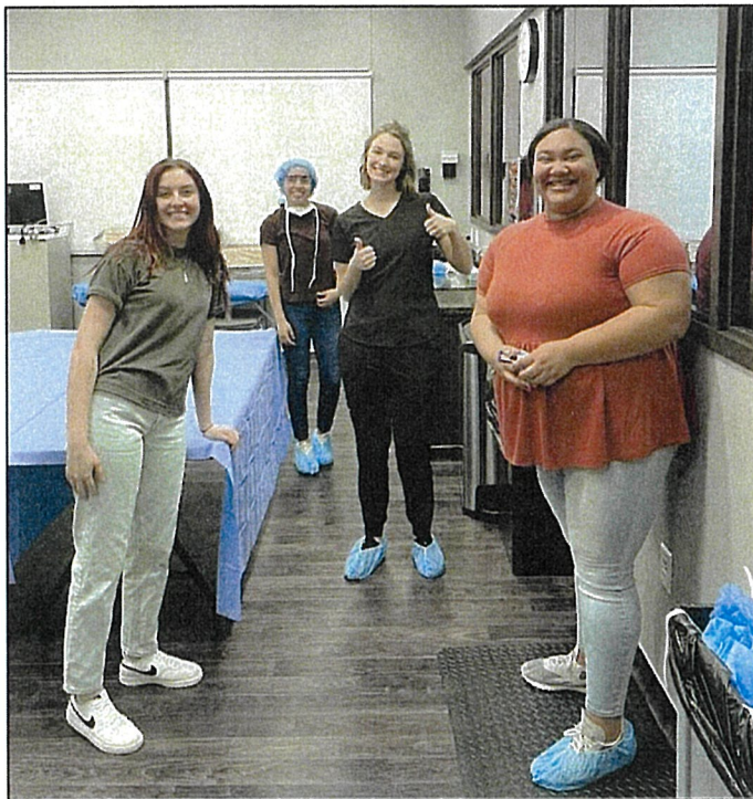
Surgical Technology students participating in the OSU COM Scrub Workshop