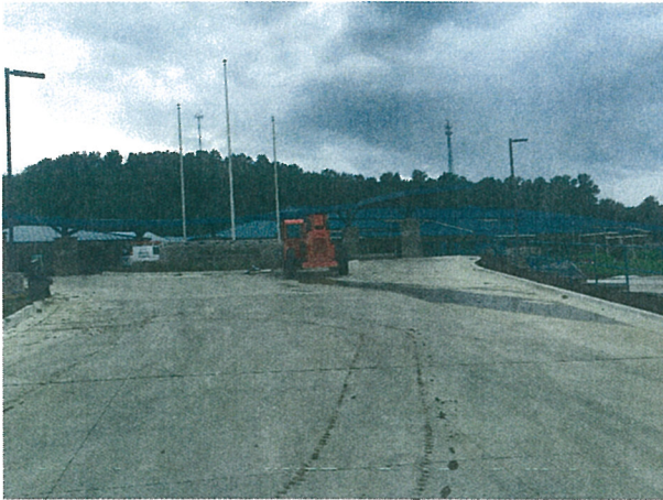
WP Mankiller Clinic