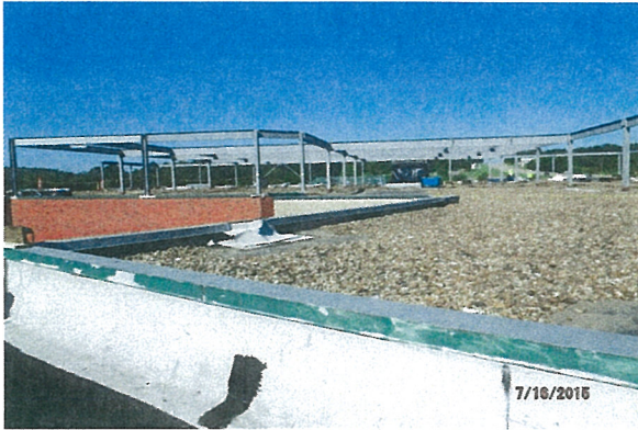
WW Keeler Complex 2 nd level