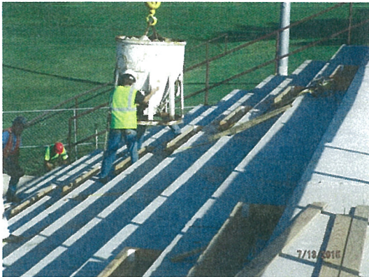
SHS Stadium improvements