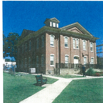
CN Capitol Masonry Project