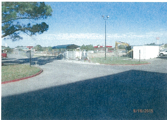
New Outpost construction