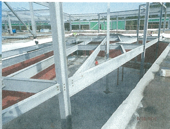
2 nd level construction on Keeler Complex