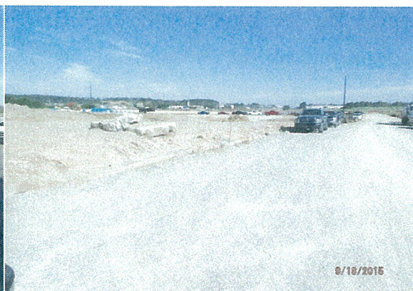
Cherokee Plaza new construction