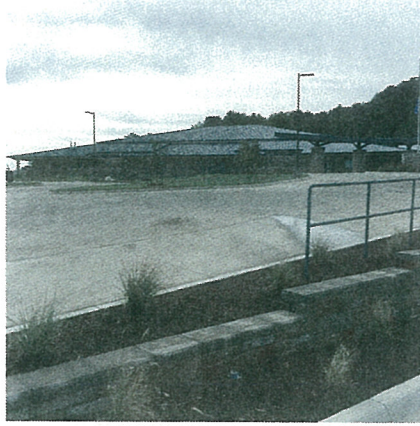
Wilma P Makiller Clinic