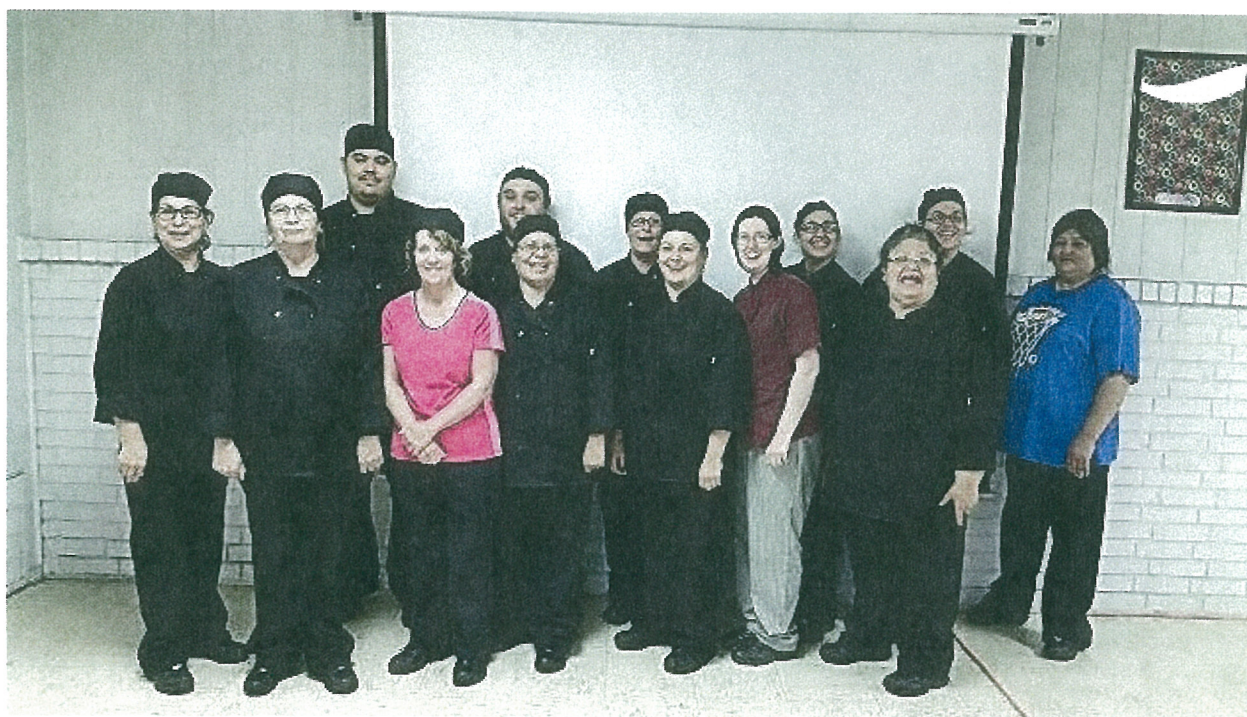
The above are pictures of our Culinary Graduating Class.