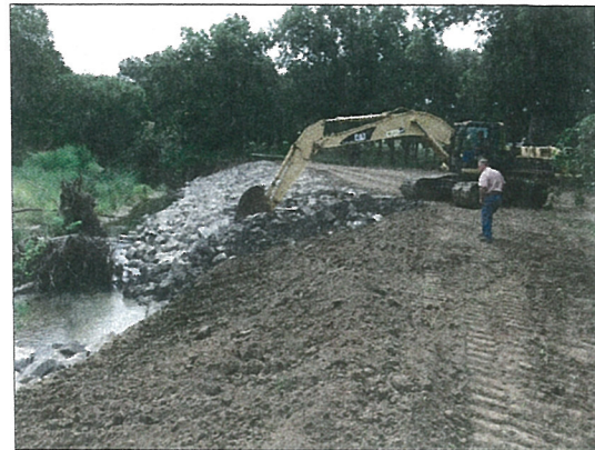
Hulbert City Park Project