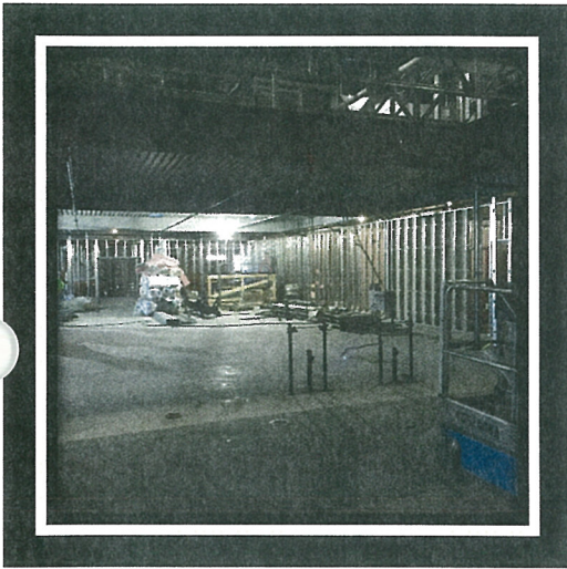
Interior – WW Keeler Complex 2 nd floor