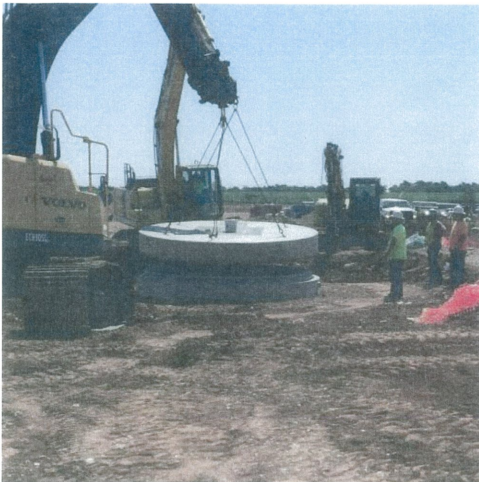
Capping the lift station – CN Outpatient Health Center