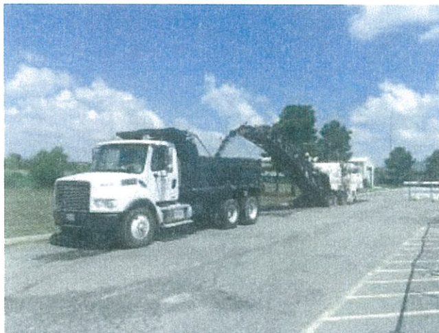
Asphalt & gravel removal parking lot – 3 Rivers Clinic