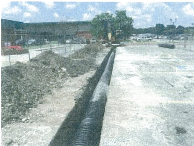
WW Keeler Complex – Repair storm drain ongoing