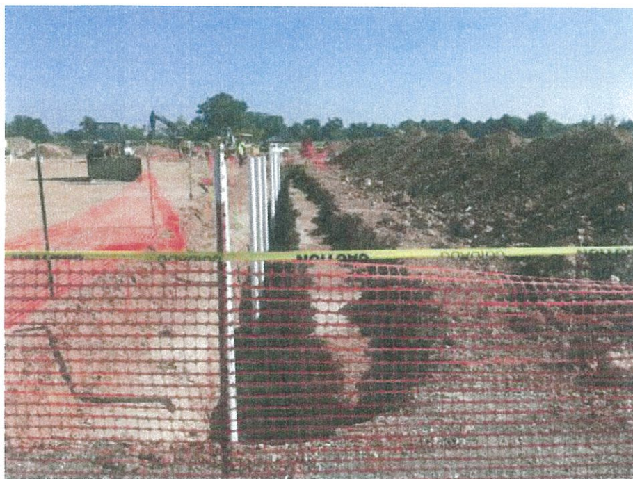
Sanitary water lines – CN Outpatient Health Center