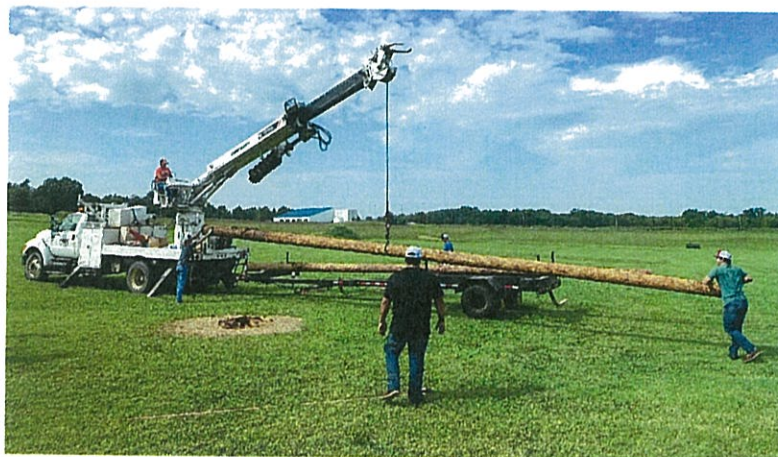
Preparation of new Lineman Training site, behind CCO, HWY 51