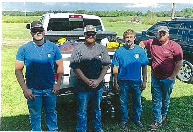
Hurricane damage assistant in Alabama

Four Lineman students went out for a week to help assist with hurricane damage in Alabama.