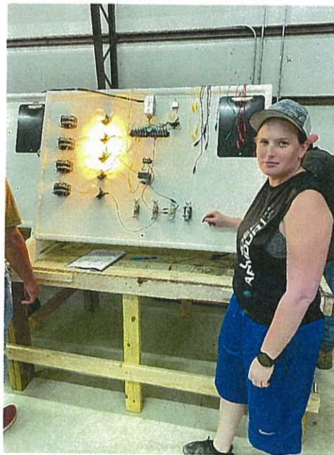
Evening HVAC Electrical Class