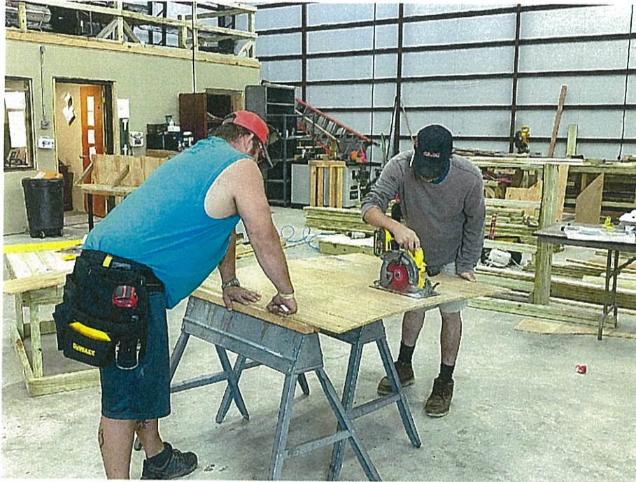
Students working on a project in the short term construction training evening classes.